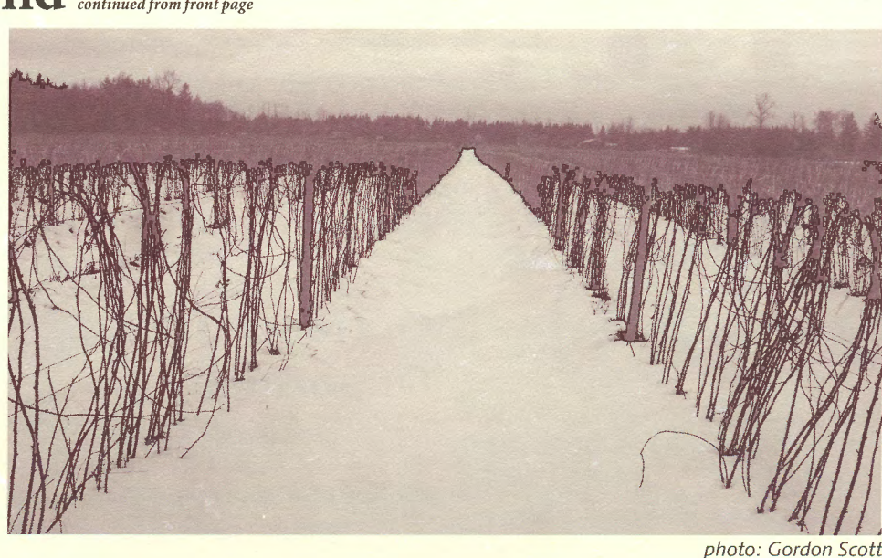
Pruned raspberries wait for spring at the Alamwala conservation easement.

to raise this valuable crop. Raspberries have long been gathered by humans. The red raspberry is indigenous to both North America and Asia Minor where the fruit was gathered in the wild by the people of Troy in the foothills of Mt. Ida around the time of Christ. Raspberries are thought to have been domesticated around the 4th century and Romans are believed to have spread cultivation throughout Europe. The first settlers from Europe discovered Native Americans gathering and eating berries where they were dried for preservation and ease of transportation. Europeans also brought cultivated raspberries to the new colonies.