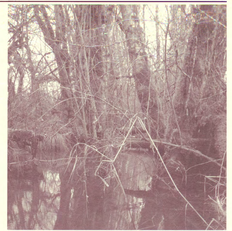
Black Slough wetlands provide rearing habitat for salmon.

The Homesteader Road Conservation Easement protects 28 acres of forested wetland in the central part of the South Fork valley. This is one of the largest undeveloped forested wetland complexes remaining in the South Fork, providing summer flow to small streams and ditches that feed into Black Slough and the South Fork River. The conservation easement was donated by Ken and Carolyn Lane, commercial fishers who bought the property for its conservation value and live nearby. The project is also part of the Williams Pipeline system upgrade to their natural gas lines in the South Fork. As part of their permit requirements Williams Pipeline agreed to help fund restoration and protection of Homesteader site, including tree planting and stream rehabilitation. Williams also donated funds to the Whatcom Land Trust Stewardship fund. The conservation easement prohibits development or tree cutting except for hazard trees and firewood for the Lanes. 🐌